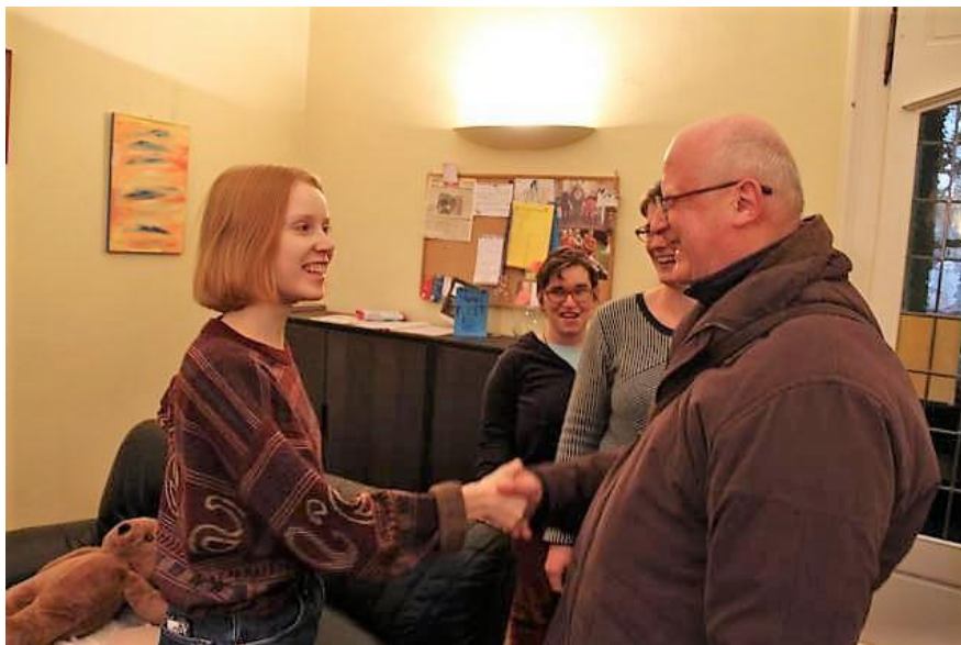
The new bisshop on a visit in L'Arche greets our ESC-volunteer