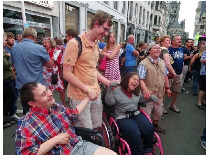
Going to a festival