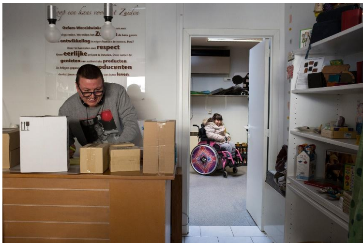
Helping in the workshop