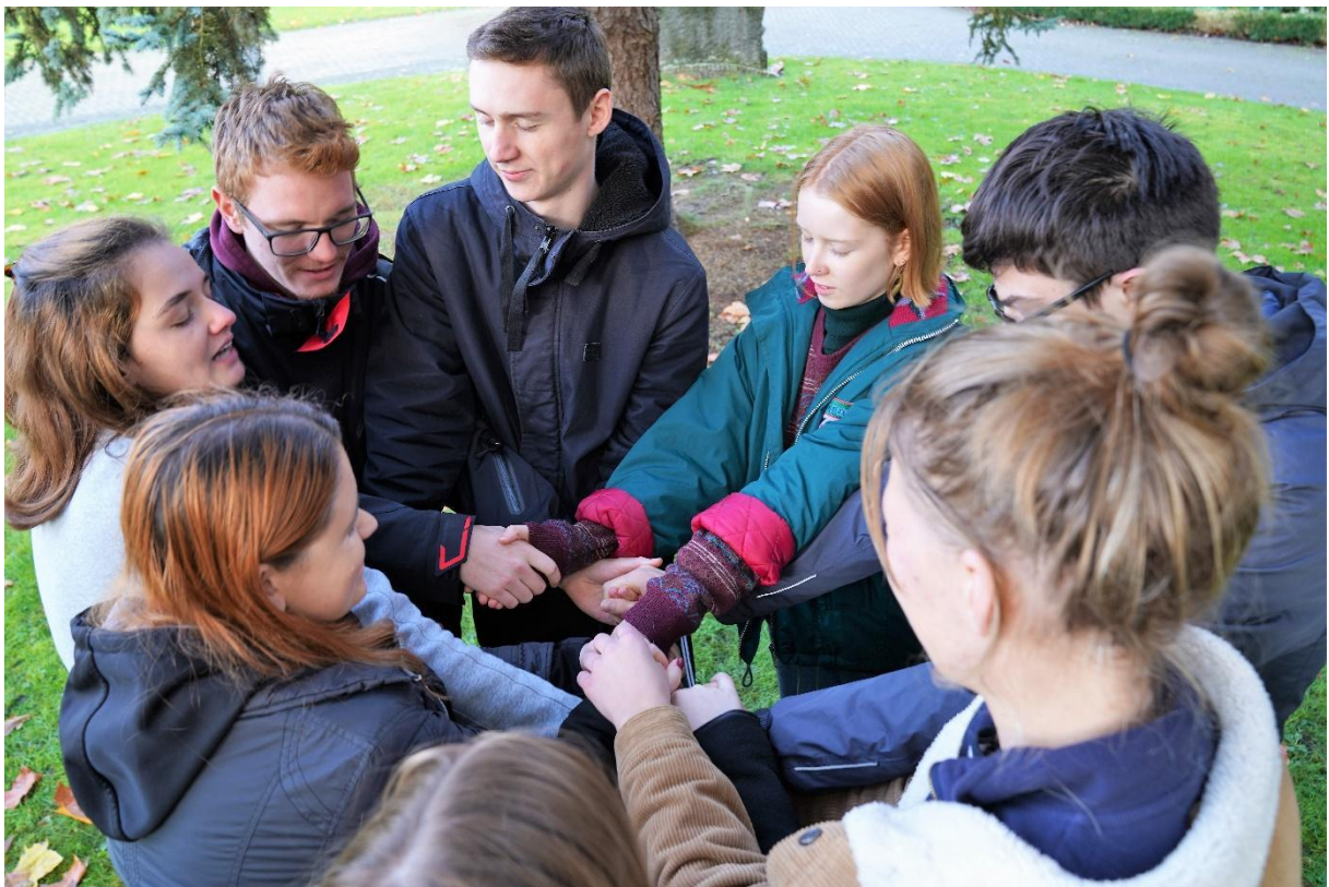
A game during the training for the young volunteers from L'Arche Flanders & Holland

This year has changed my life forever. I could grow as a human.